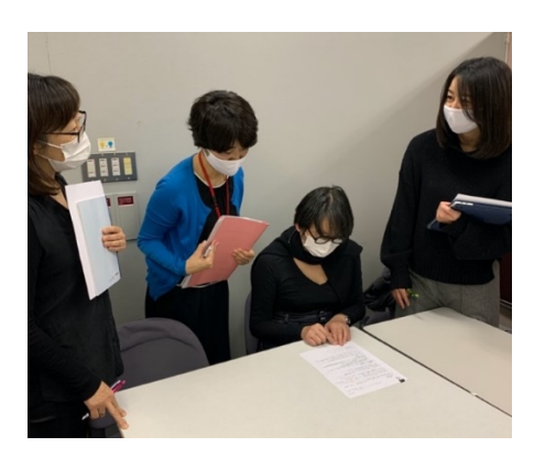
Photo2: Meeting at the PHC with PHNs