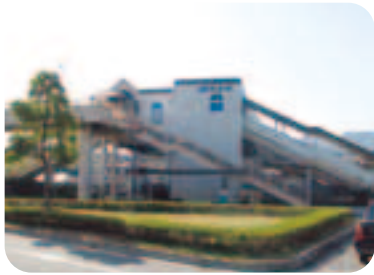
JR Ajina Station (nearest station from JRCHCN)

Contact: Secretariat for the International Hiroshima Conference on Caring and Peace c/o Plando Japan Desk, Nippon Travel Agency Co., Ltd. Osaka Ekimae No. 4 Bldg. 5F 1-11-4, Umeda, Kita-ku, Osaka, 530-0001 Japan TEL: +81-6-6342-0212 FAX: 81-6-6342-0214 Email: ihccp_hij@nta.co.jp