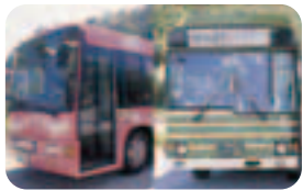
Sakura Bus To visit JRCHCN, take Sakura Bus, circulating through the Hatsukaichi-city, and frequent bus service is available.