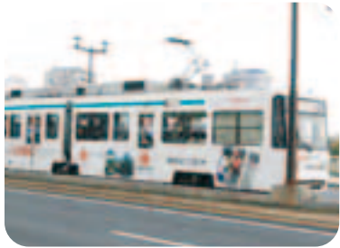
Streetcar Streetcar ties Hiroshima-city and Miyajima-entrance